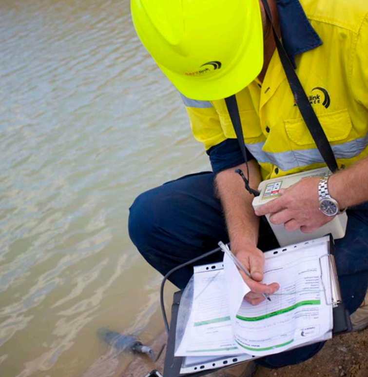
TMR water sampling.