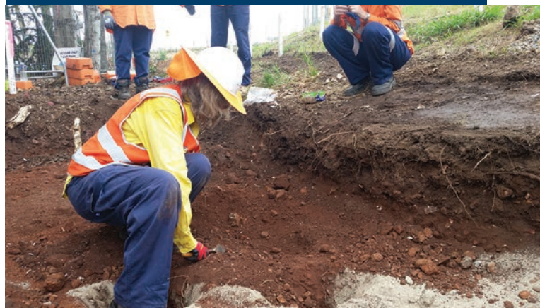
TMR Cultural team excavating.

If you would like further information or would like to provide specific feedback on environmental and culture heritage management for the project, please get in touch with the project team on the details below.