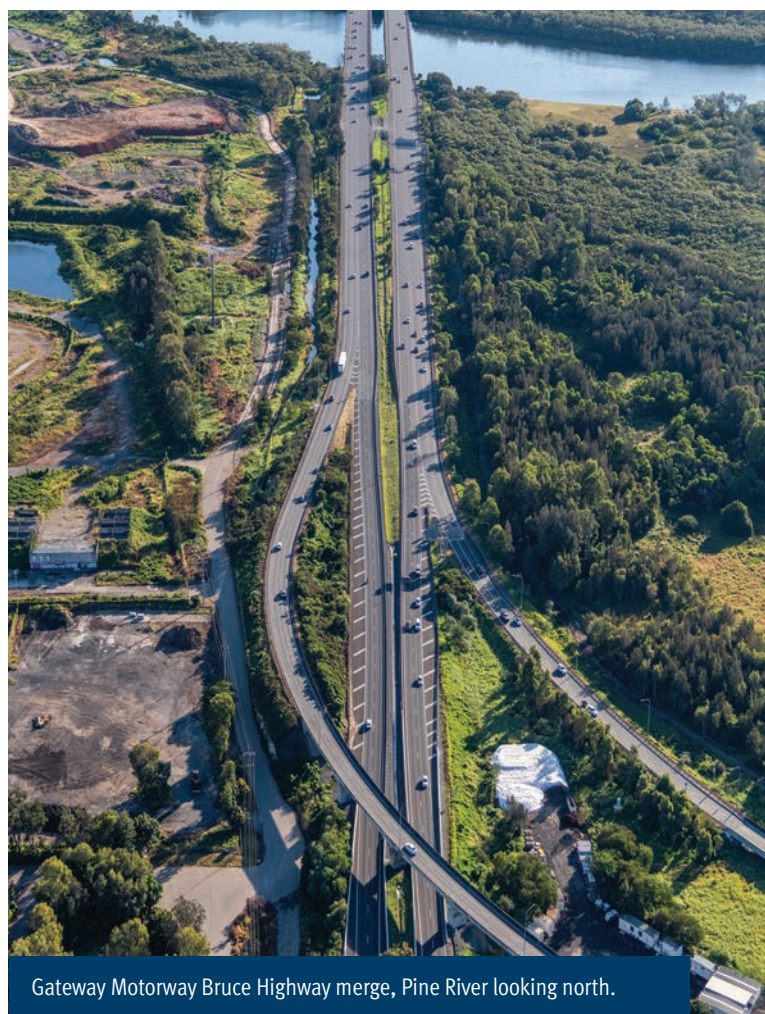
Gateway Motorway Bruce Highway merge, Pine River looking north.

TMR recognises the area surrounding the project is home to many animals, including koalas. TMR is working with the Department of Environment and Science and local councils to undertake rigorous assessments in accordance with relevant legislation and to identify opportunities to protect local wildlife.