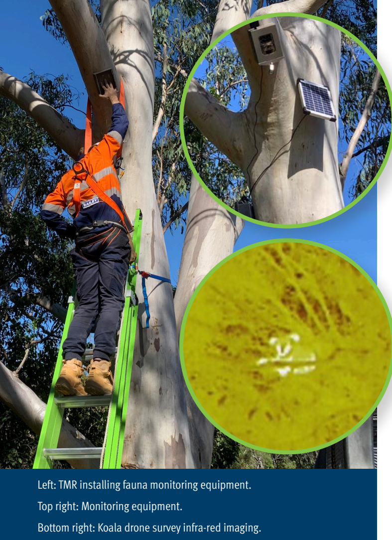
Left: TMR installing fauna monitoring equipment.