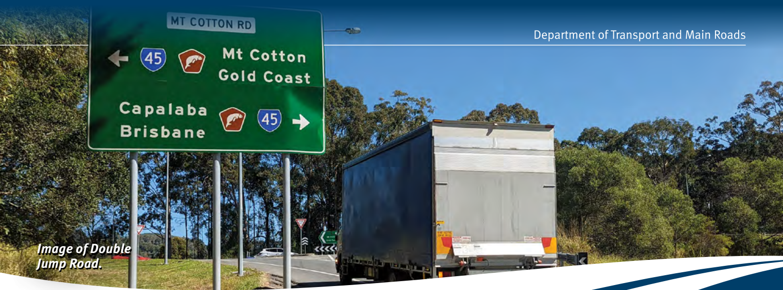
Image of Double Jump Road.