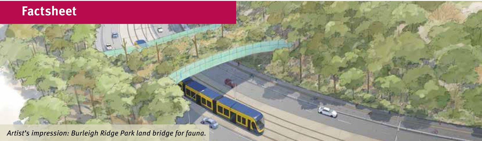
Artist's impression: Burleigh Ridge Park land bridge for fauna.

Gold Coast Light Rail Stage 4 will deliver a 13km extension south of the Gold Coast Light Rail Stage 3, linking Burleigh Heads to Coolangatta, via the Gold Coast Airport. The Queensland Government has committed $1.5 million to undertake the Gold Coast Highway (Tugun to Coolangatta) Multi-modal Corridor Study . A further $5 million jointly funded by the Queensland Government and City of Gold Coast has been committed to undertake a Preliminary Business Case for Gold Coast Light Rail Stage 4 from Burleigh Heads to Coolangatta, via the Gold Coast Airport.