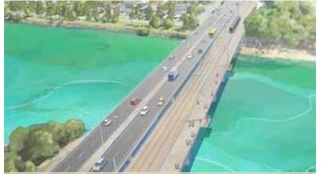
Artist's impression: Active transport bridge, including bike riding, across Tallebudgera Creek.

The project team will work closely with the Department of Environment and Science and Jellurgal Aboriginal Cultural Centre at Burleigh Heads to maintain this important cultural centre in its current location, and address car parking and ongoing access.